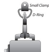
Snap Clip (Removable)

▶ 2 Mounting Options: Snap Clip —easily removable or Large Clamp for shortened semi-permanent mounting