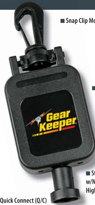
■ Snap Clip Mount